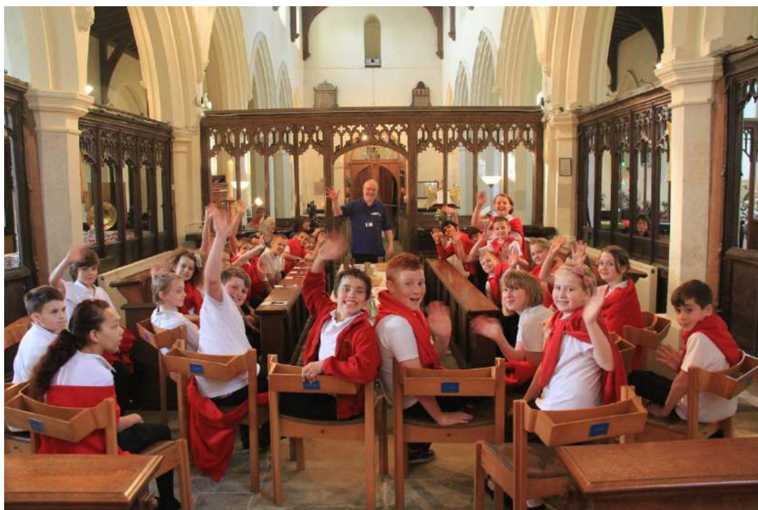
Easter Journey 2012