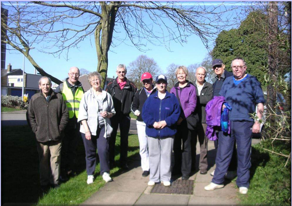
Sponsored Walk raising funds for The Easter Journey

St Mary's Church, Shephall St Nicholas Church St Peter's Church The Belling Charitable Trust The Church & Community Fund United Reformed Church Individual donors