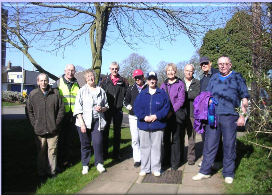
Sponsored Walk raising funds for The Easter Journey

St Mary's Church, Shephall St Nicholas Church St Peter's Church The Belling Charitable Trust The Church & Community Fund United Reformed Church Individual donors